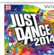
Just Dance 2014