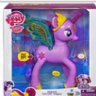
My Little Pony