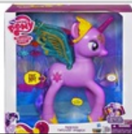
My Little Pony