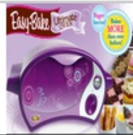
Easy Bake Oven