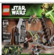
Star Wars Legos