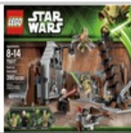
Star Wars Legos