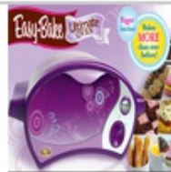
Easy Bake Oven