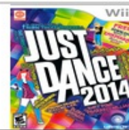
Just Dance 2014